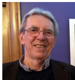
Prof. Dr. Jean-Pierre Sauvage

University of Strasbourg, France Nobel Prize in Chemistry 2016 with J. Fraser Stoddart and Ben Feringa